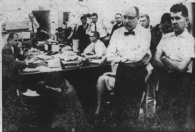
These faces in The Denver Post newsroom mirror the grief displayed by thousands of Denverites when they heard bad news.