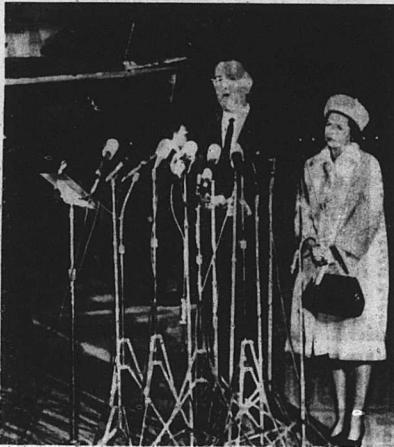
The new President, Lyndon B. Johnson, his wife beside him, makes some brief remarks at Andrews Air Force Base in Washington, Friday night. He told the reporters, "I will do my best. That is all that I can do."