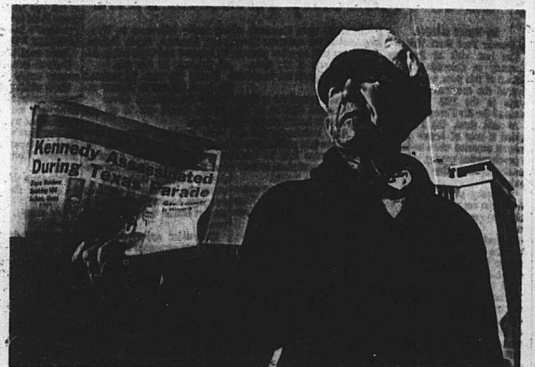
Stark headlines on the home edition of The Denver Post Friday told to a stunned populace the story of the death of President Kennedy. The reaction was shock, disbelief and anger at the tragic news. Residents gathered at newsstands and read in silence details of the slaying.