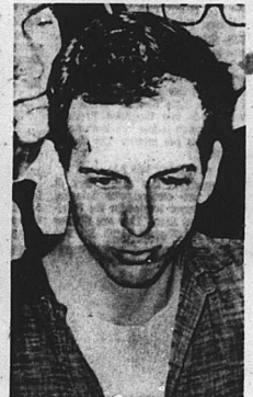
Lee Harvey Oswald, 24, has been charged with the slaying of President Kennedy and a Dallas policeman. He was arrested by police at a Dallas theater. Suspect denied the killings.